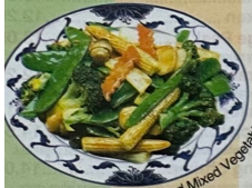
Sautéed Mixed Vegetable