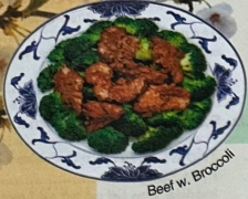
Beef w. Broccoli

We Can Alter Hot & Spicy Dishes According To Your Taste