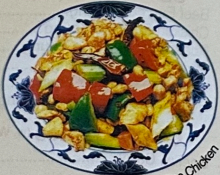
Kung Pao Chicken