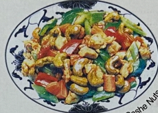
Chicken w. Cashew Nuts