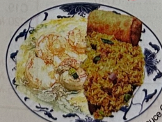
Shrimp w. Lobster Sauce Combo