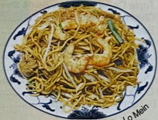
Shrimp Lo Mein