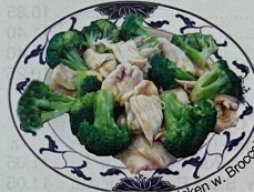
Chicken w. Broccoli