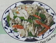
Moo Goo Gai Pan