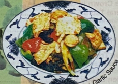
Chicken w. Garlic Sauce